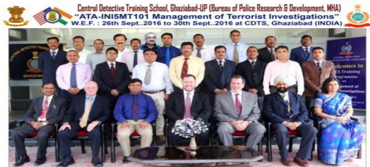
Photo session with participants and faculties of ATA Course on "Management of Terrorist Investigations" w.e.f. 26.09.2016 to 30.09.2016 at CDTS, Ghaziabad.

02 ATA courses were conducted at CDTS, Ghaziabad on the subject Vital Infrastructure Security Course and Tactical Medical Training Course in which 45 officers were trained.