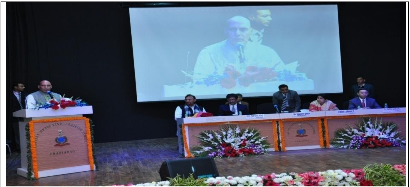
Sh. Rajnath Singh, Union Home Minister addressing the Dignitaries in the Auditorium during inauguration of new campus of CDTS, Ghaziabad.