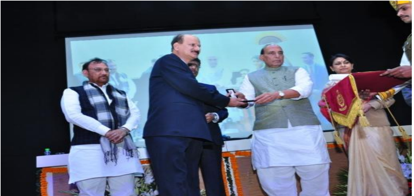
Union Home Minister Sh. Rajnath Singh giving Police Medals for Meritorious Service to the officers of BPR&D/CDTS