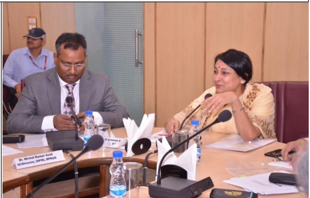
Deliberation of Recommendations of DsGP/IsGP Conference at BPR&D, HQs on 28.10.2016

A meeting/conference was held on 28th October, 2016 on Empowerment of Women Involving Policing Activities. A format indicating traits for the ranks of Constable, Sub-Inspector and Dy. SP was discussed during the meeting. Various world-wide methods and modalities adopted to test the aptitude were also discussed in the meeting.