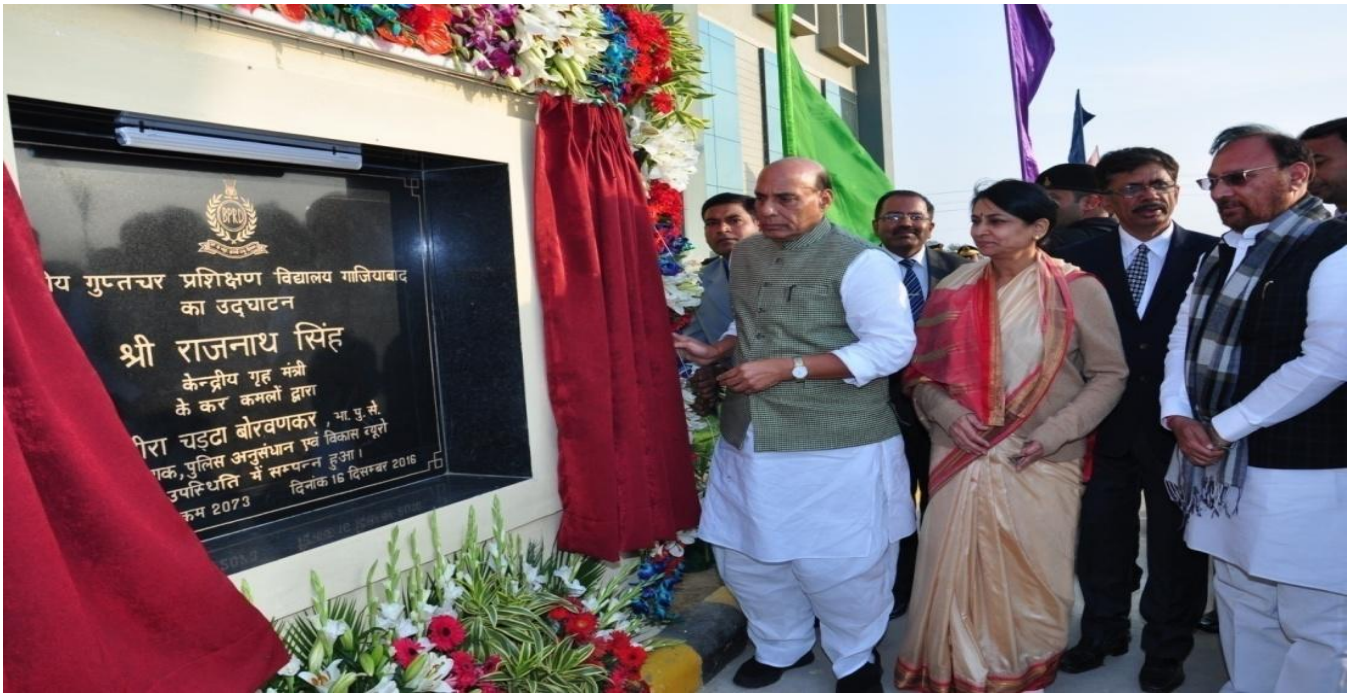
Sh. Rajnath Singh, Union Home Minister inaugurating the New Building of CDTs, Ghaziabad.

BUREAU OF POLICE RESEARCH AND DEVELOPMENT Volume: 2 September-December, 2016 Issue-2