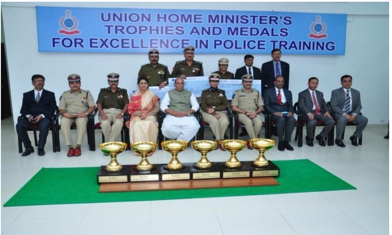
A Photo session with winners of Trophies & Medals for Excellence in Police Training